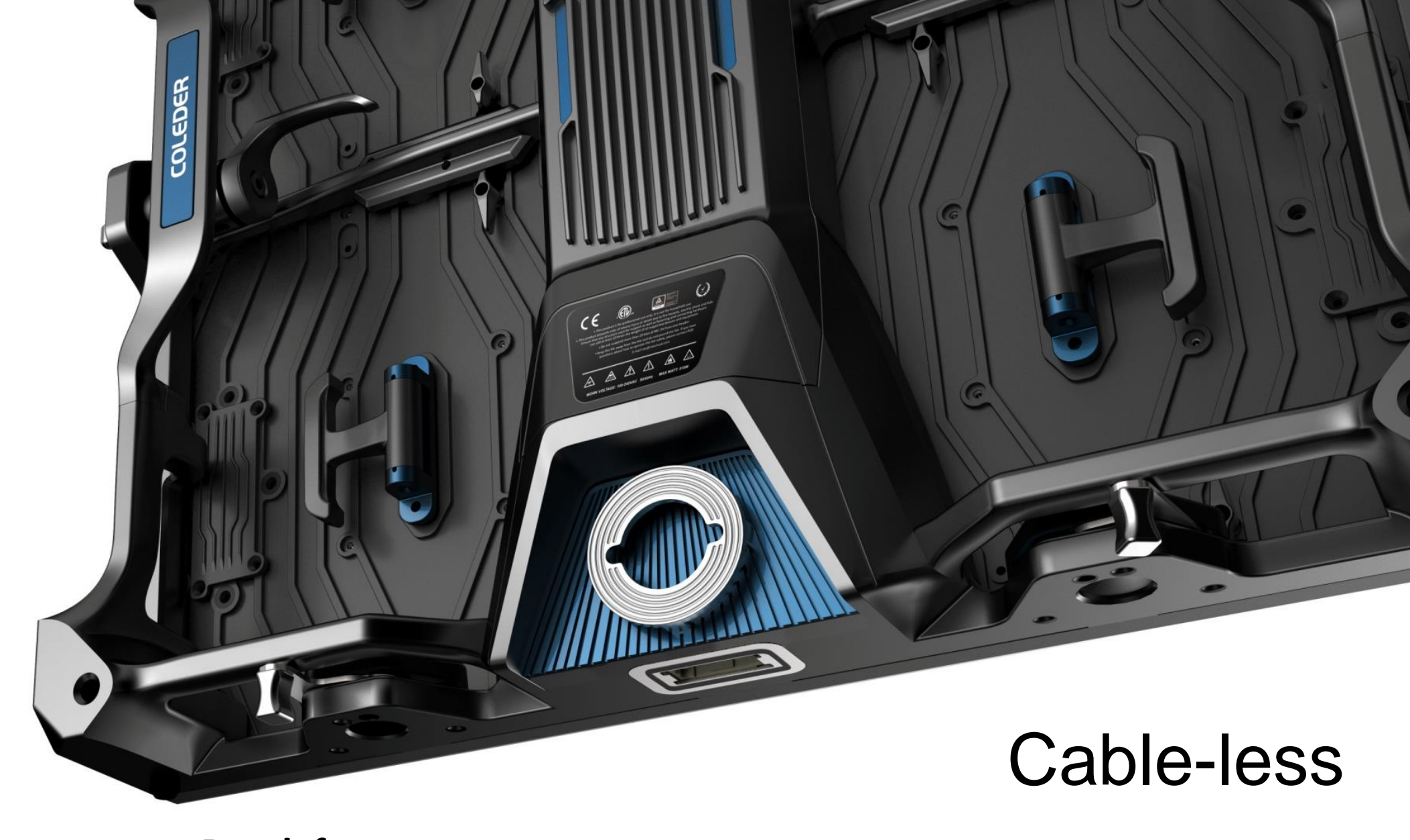
Break free from piles of jumper cables. Setting up a screen has never been so easy.