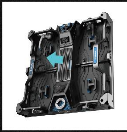
Fast parts and components maintenance

Road Ready series is the fastest industry- wide in terms of installation and dismantle, featuring a 50% less time than makes relacement a simple plug and play. The 3-in-1 integrated back of power with its magnetic front design, modules can be taken out by a simple push. industry average with its patented connector design.